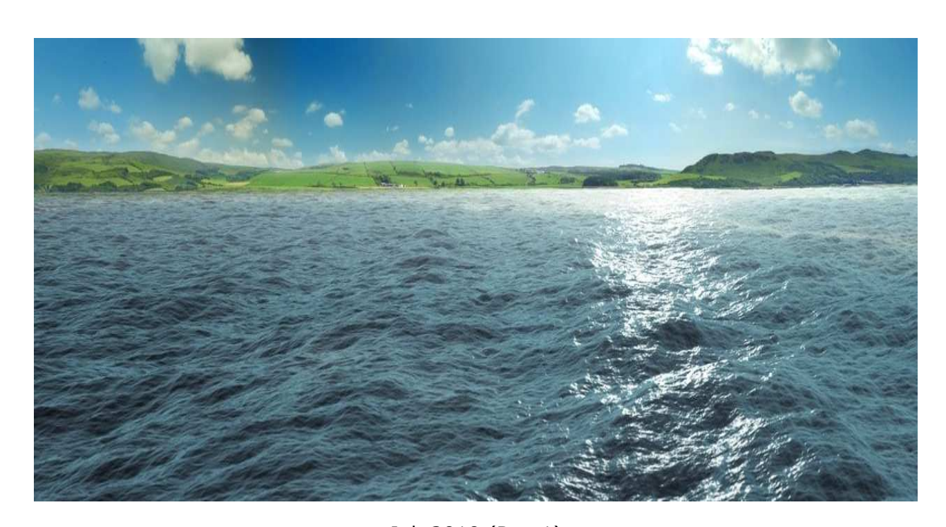
Jul. 2019 (Rev.1)